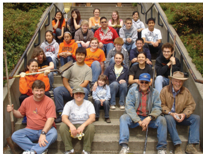
Key Club students and community members help with the campus cleanup in April, 2009.

Our Student Council has qualified as one of the top ten ASB's in our state. Efforts by ASB and our Leadership Classes collected over 13,000 pounds of food for the Central Kitsap Food Bank in conjunction with the VFW (Veterans of Foreign Wars). This commitment to service enables our students to give back to our community. If you would like to volunteer, please call 662-2460.